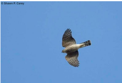
Figure 1. Sharp-shinned in flight by Shawn Carey.

Skies partly cloudy with a thick haze. Temperature is 45 degrees and visibility 15 km with winds steady 5-10 mph from the north. Just after 8 am the flight begins as two Sharp-shinned Hawks skim over the rocks from due South and head low over the valley past Hunters Field to northeast—seemingly traveling together and fighting the headwind.