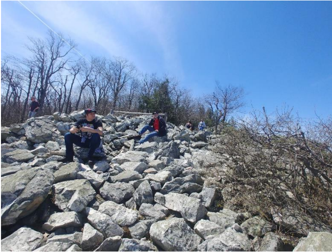
Figure 3. A few visitors help spot including a new young birder and his grandfather