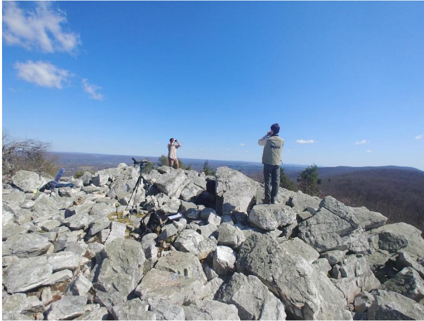
Figure 2. Matthew and Diego scanning for birds.

For Raptorthon official totals I include migrating raptors as well as resident raptors. For any resident, I only count the highest number seen at one time, such as the 3 Black Vultures, 3 Red-tailed Hawks and 8 Turkey Vultures. We deem a bird a “migrant” if it comes from S or SW and leaves to N or NE and flies in direct manner, differing from local birds meandering movements or the birds heading west or south. Non-raptor migrants tallied for the morning include blue jays, tree and barn swallows and