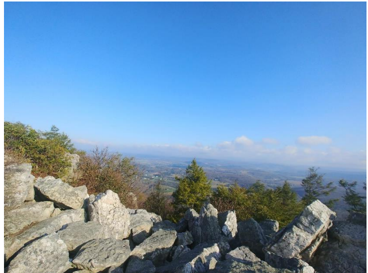
Figure 4. north view in morning.

Counting for Conservation is truly what we were doing in our Raptorthon each year as we strive to maintain the stability of long-term monitoring efforts at Hawk Mountain and continentally so we can better track the numbers of the raptors and inform conservation planning at a national and international scale.